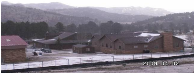
View from private balcony. 2 nd floor

While you might be tempted to stay off site at a near by lodge be warned that the YMCA is tucked back in the Rocky Mountain Forest and a commute after dark on the winding mountain roads offers even the locals a challenge.